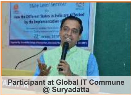
Participant at Global IT Commune @ Suryadatta