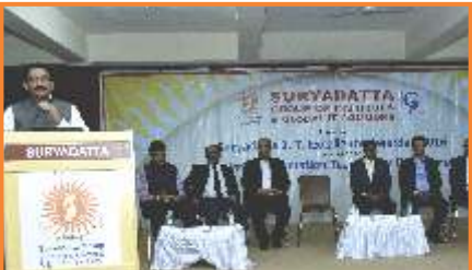
Global IT Commune 2016

As a part of Industry - Institute Interaction, Suryadatta Group of Institutes Suryadatta College of Management Information Research & Technology (SCMIRT) , Pune had organized a State Level IT Seminars“Careers & Opportunities in IT Sector & how to prepare for successful corporate career in IT%. The summit explored the various avenues in IT sector to students willing to pursue a career in IT. The eminent personalities were present from the IT Sector to guide our students.