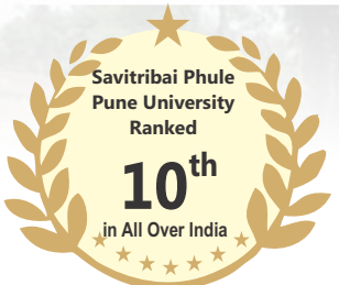
by NIRF Ranking 2019

The College offers an array of Bachelors degree programs in Business Administration, Information Technology, Commerce, Animation and Masters Degree Programs in the field of Information Technology and Commerce.