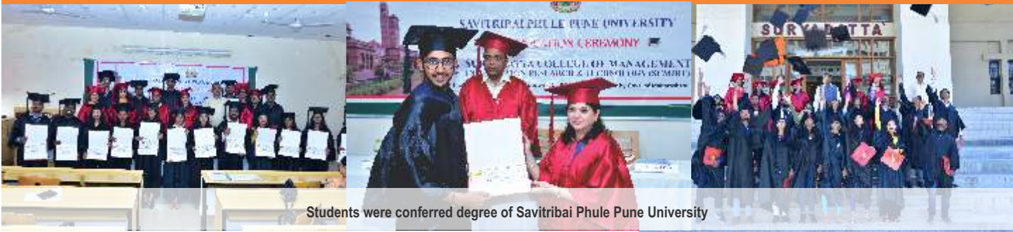
Students were conferred degree of Savitribai Phule Pune University